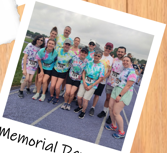
Memorial Day 5K