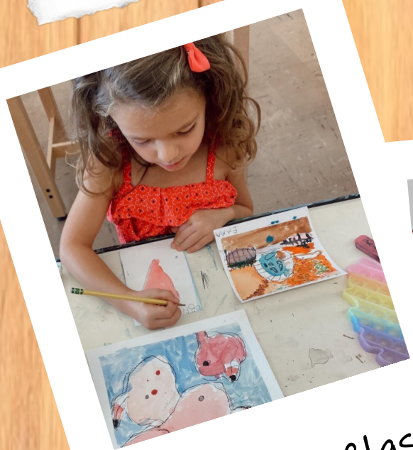
Youth Art Class