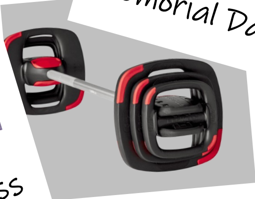
New BodyPump Equipment!

130 S. Academy Drive Ephrata 717-738-1167 ephratarec.com