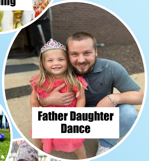
Father Daughter Dance