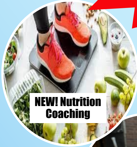
NEW! Nutrition Coaching

Looking for a job this summer? Now hiring Lifeguards and Camp Counselors!