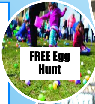
FREE Egg Hunt