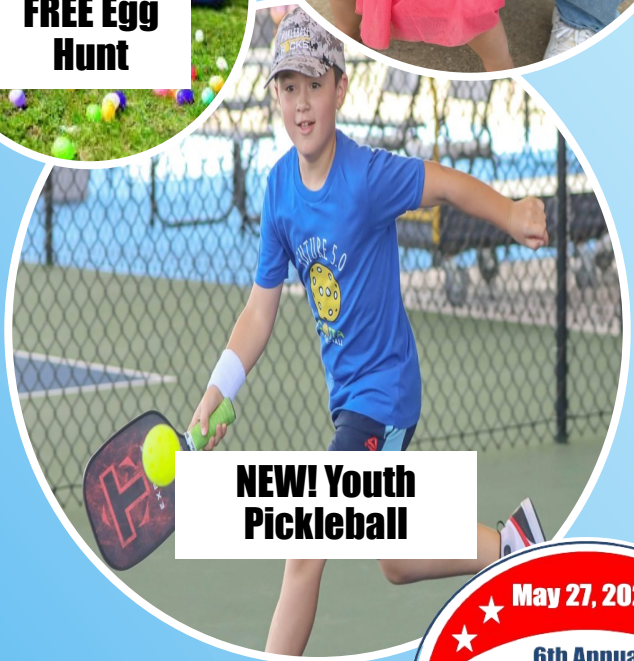
NEW! Youth Pickleball